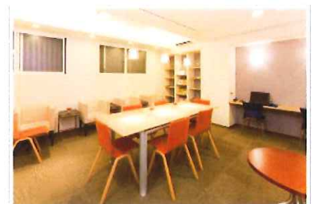
a common room

Check-out date: August 10 (Sat.) before 10:00 am